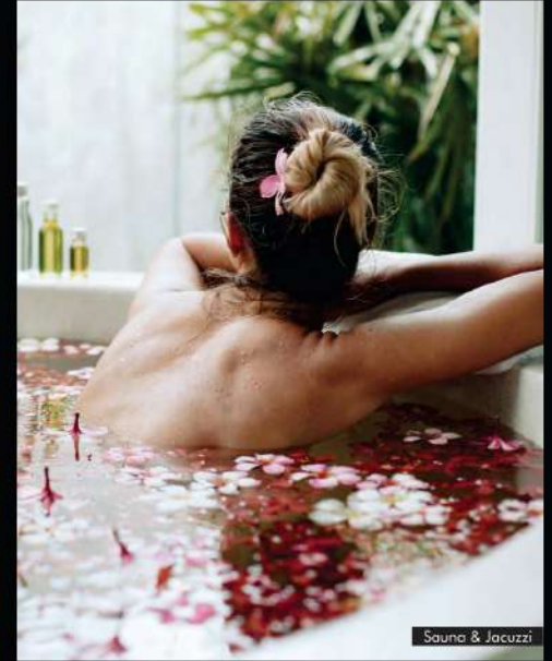
Sauna & Jacuzzi