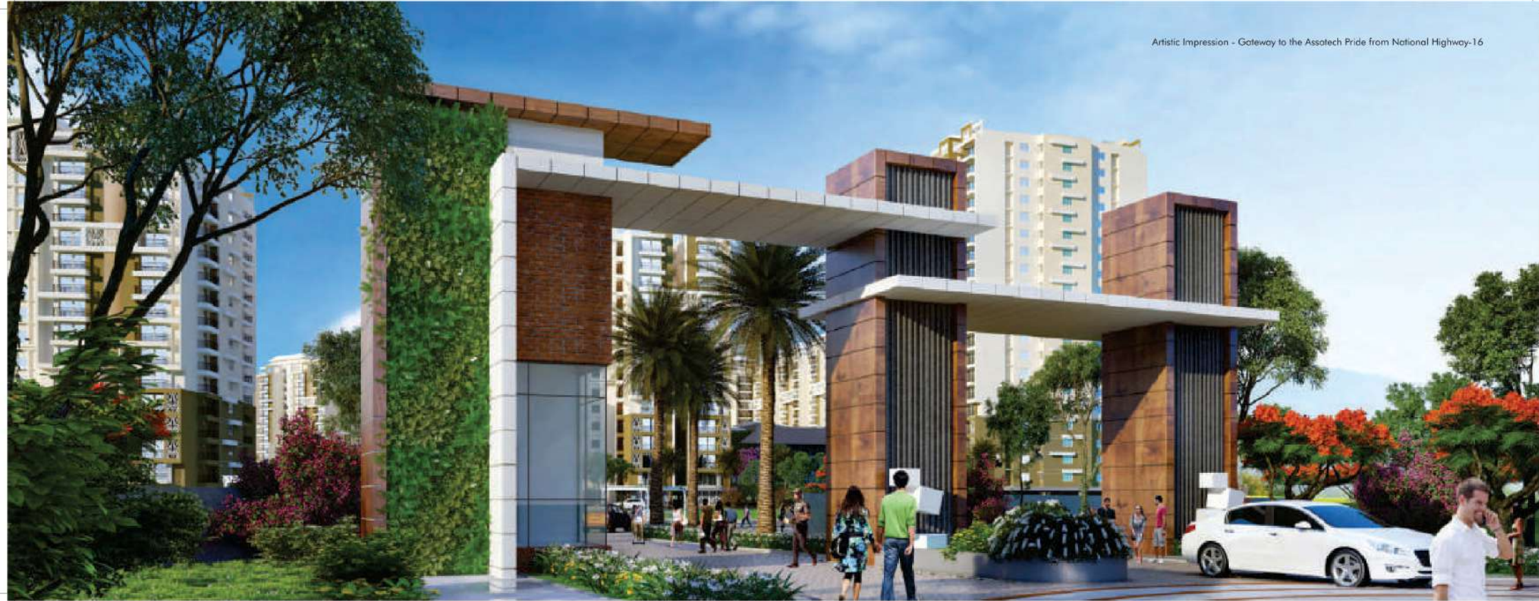
Artistic Impression - Gateway to the Assotech Pride from National Highway-16