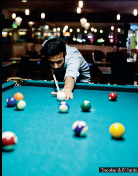
Snooker & Billiards